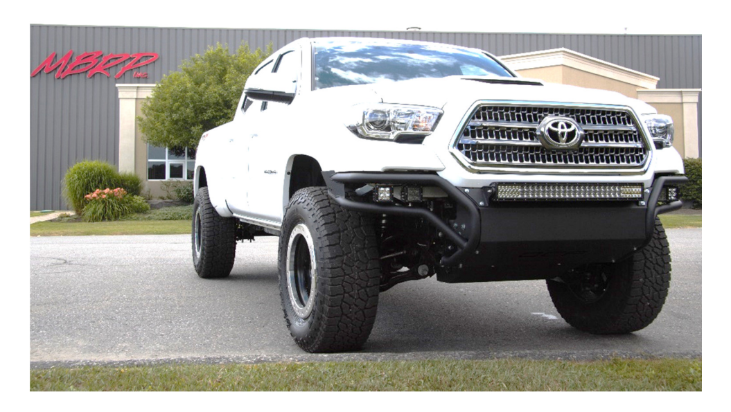
Congratulations! You're finished! We are sure that you will enjoy this Off Camber Fabrications product by MBRP Inc.

8. Install the front cover panel using the eight (8) black M8 Hex Screws . Do not fully tighten the fasteners until all eight have been threaded in. Use the supplied M8 Washers and M8 Nuts for the bottom tab attachment. Refer to Figure 11.